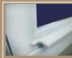
Heavy duty double wall lift rails make it easy to open and close the sashes.