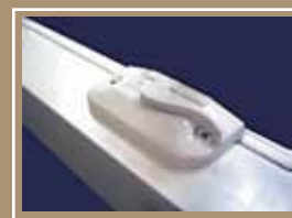
Double cam-action locks found on all window widths over 25 3/4"

Double hung windows offer a tilt-in top and bottom sash offering easy cleaning from inside your home.