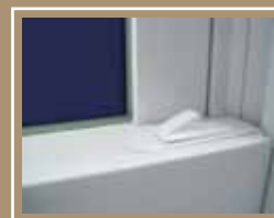
Shark fin tilt latches.